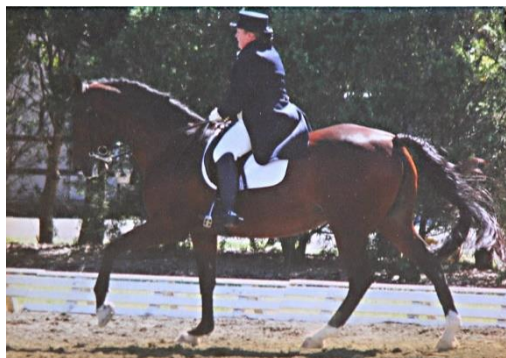
APH Rocella: Reserve Advanced Champion

riding. We had moved to Annangrove in 1988 and I recall watching Horseworld being built whilst on my trail rides.